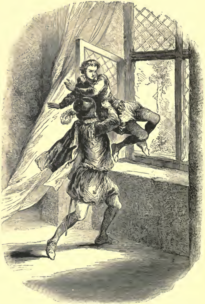
BRIQUET AT THE WINDOW